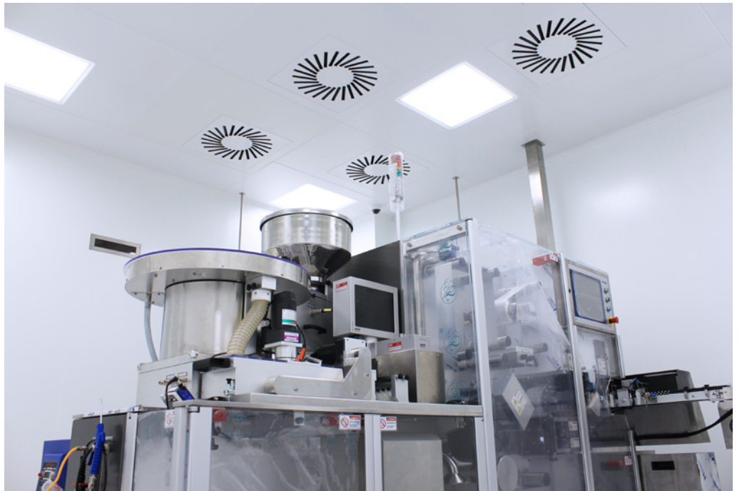
Pharmaceutical production | Canonpharma | Russia | 2020