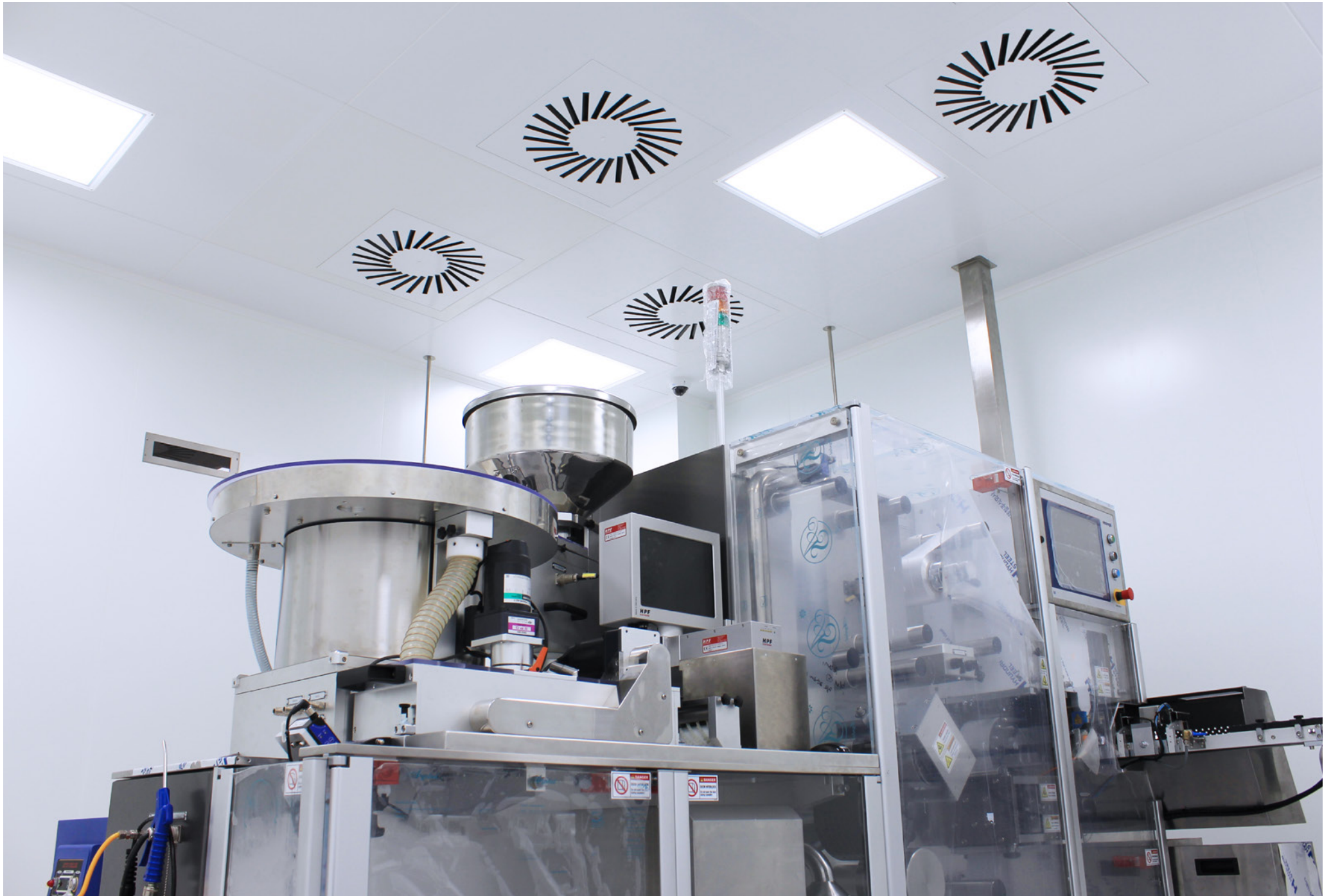
Pharmaceutical production | Canonpharma | Russia | 2020