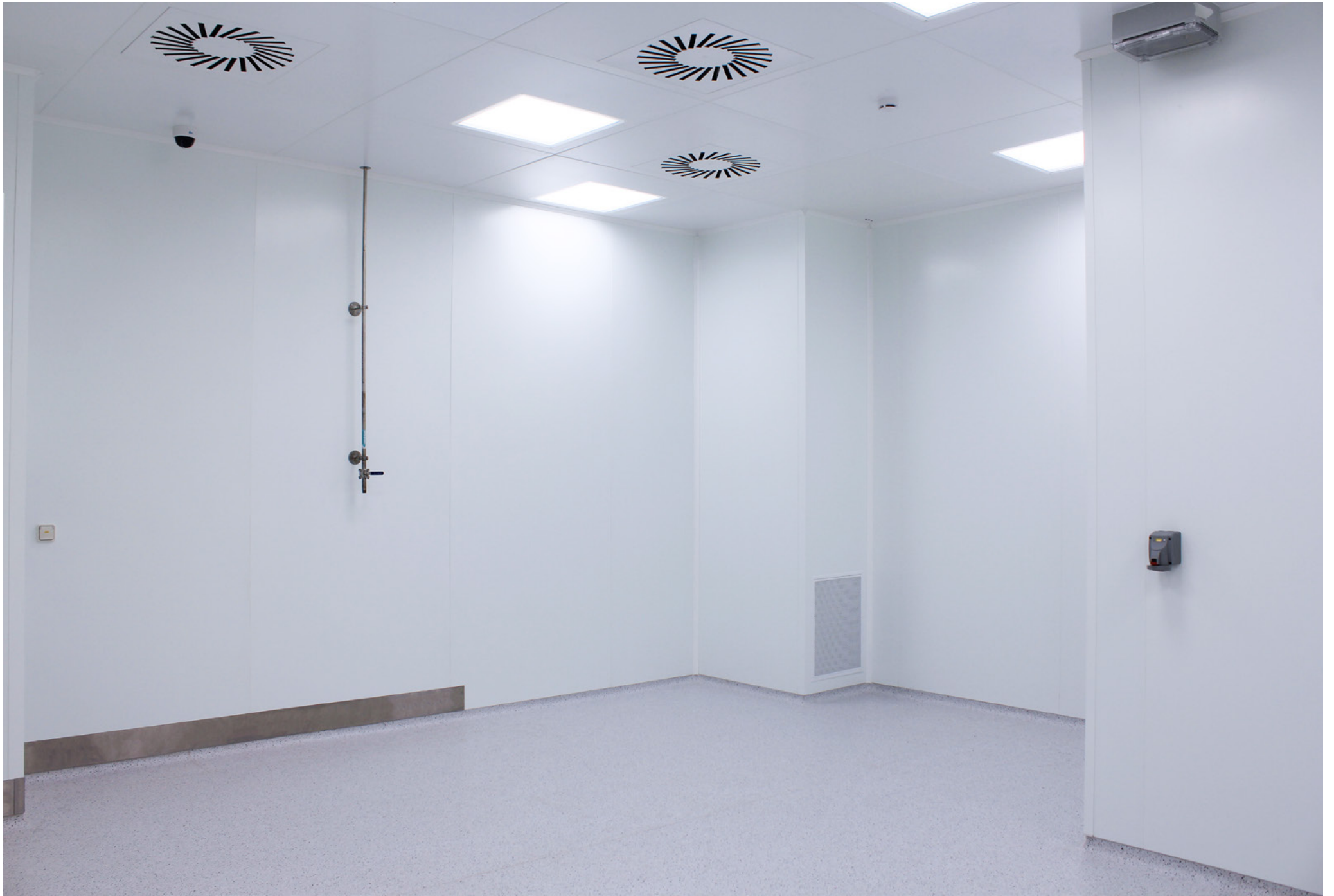
Pharmaceutical production | Canonpharma | Russia | 2020