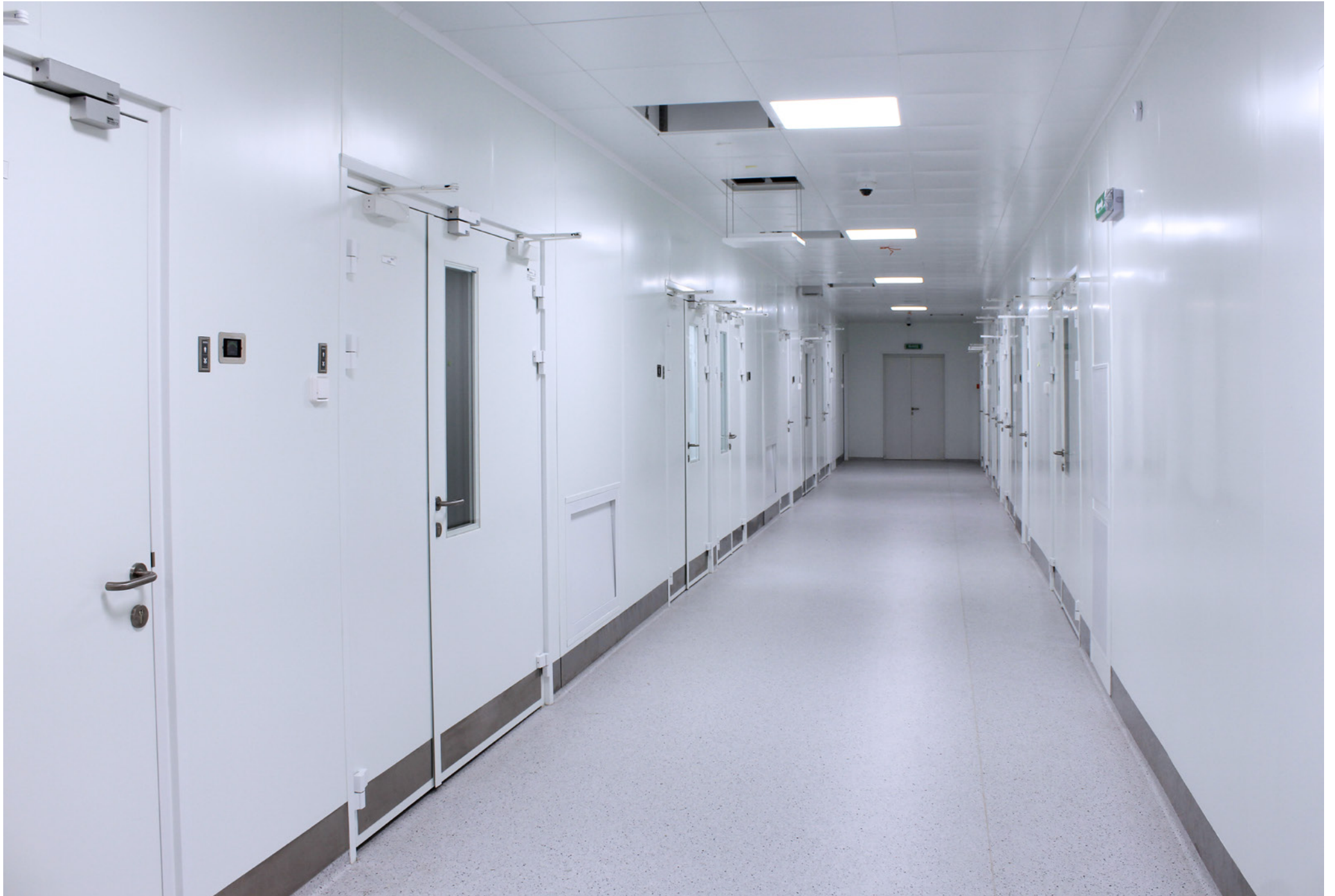
Pharmaceutical production | Canonpharma | Russia | 2020