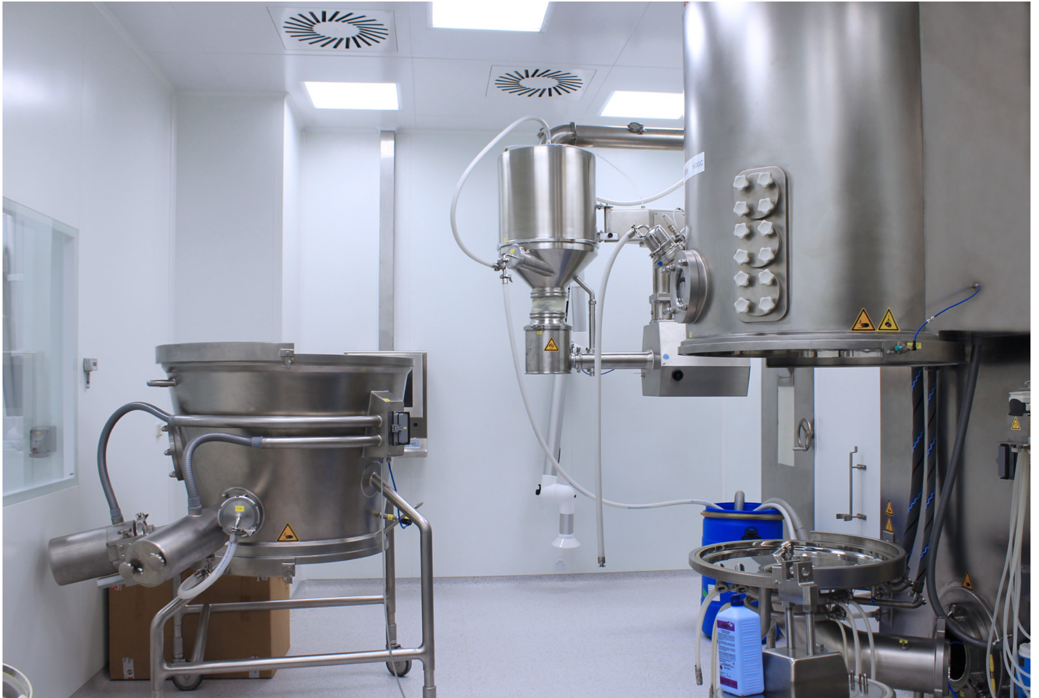
Pharmaceutical production | Canonpharma | Russia | 2020