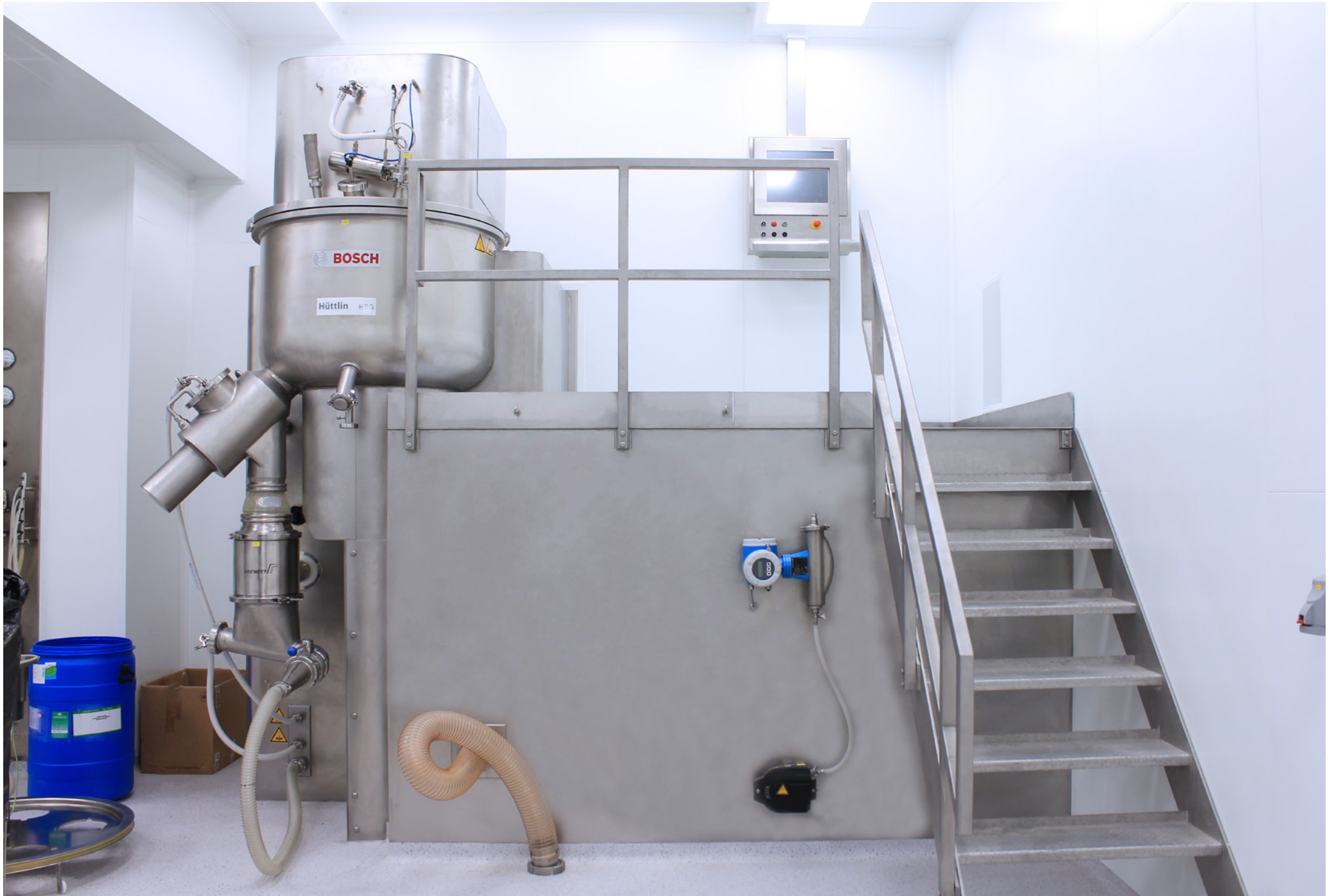
Pharmaceutical production | Canonpharma | Russia | 2020