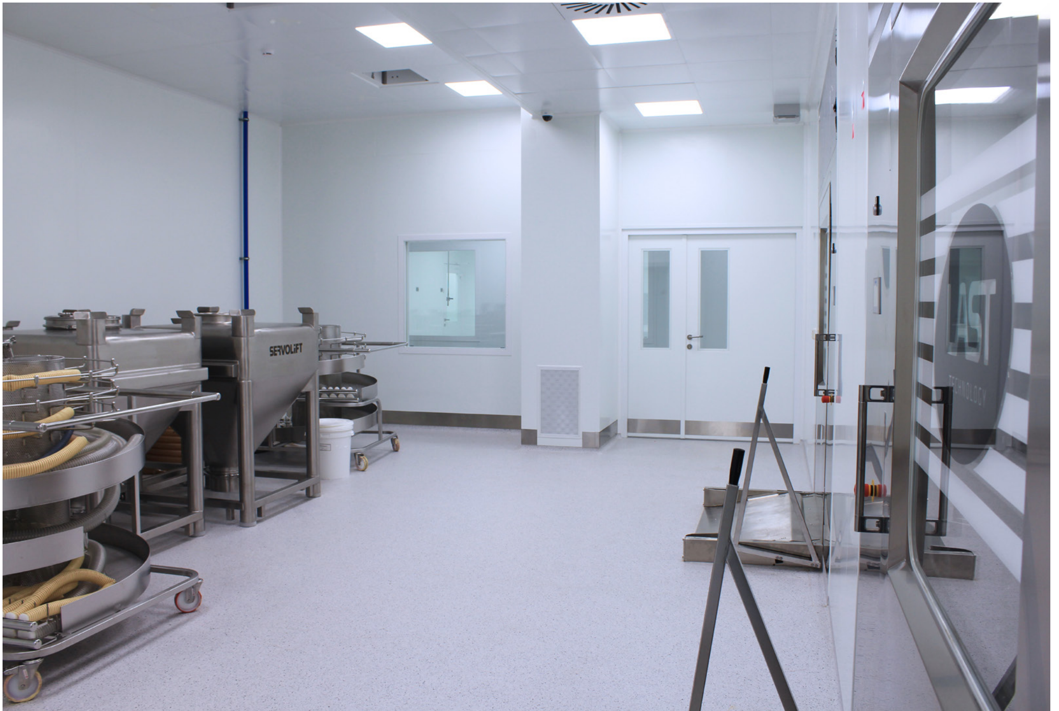
Pharmaceutical production | Canonpharma | Russia | 2020