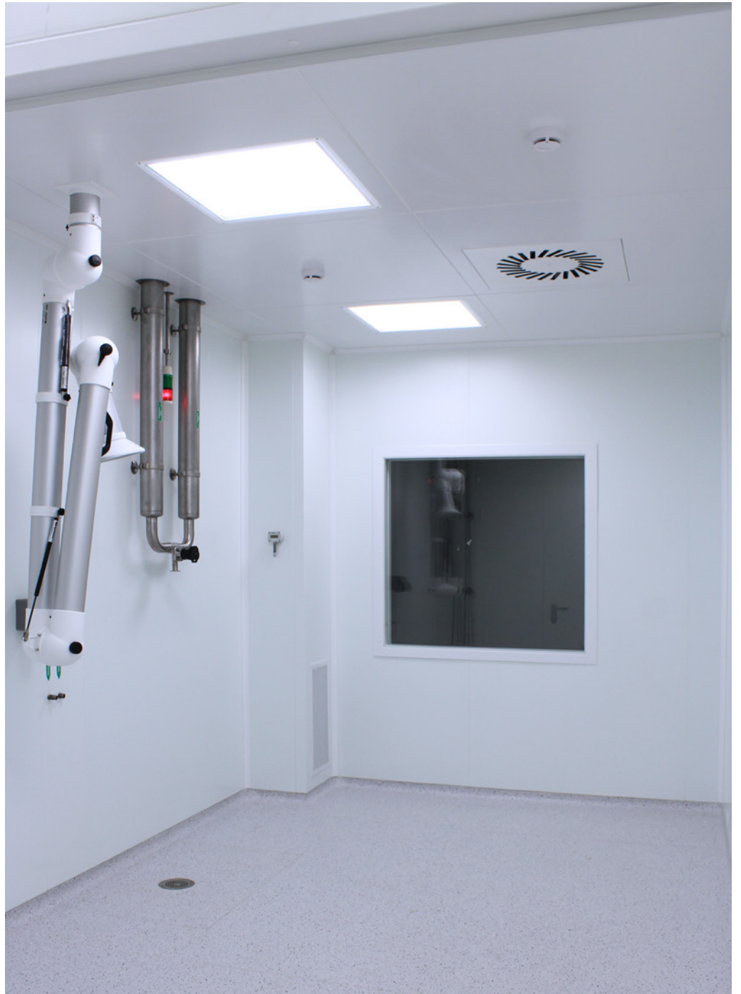
Pharmaceutical production | Canonpharma | Russia | 2020