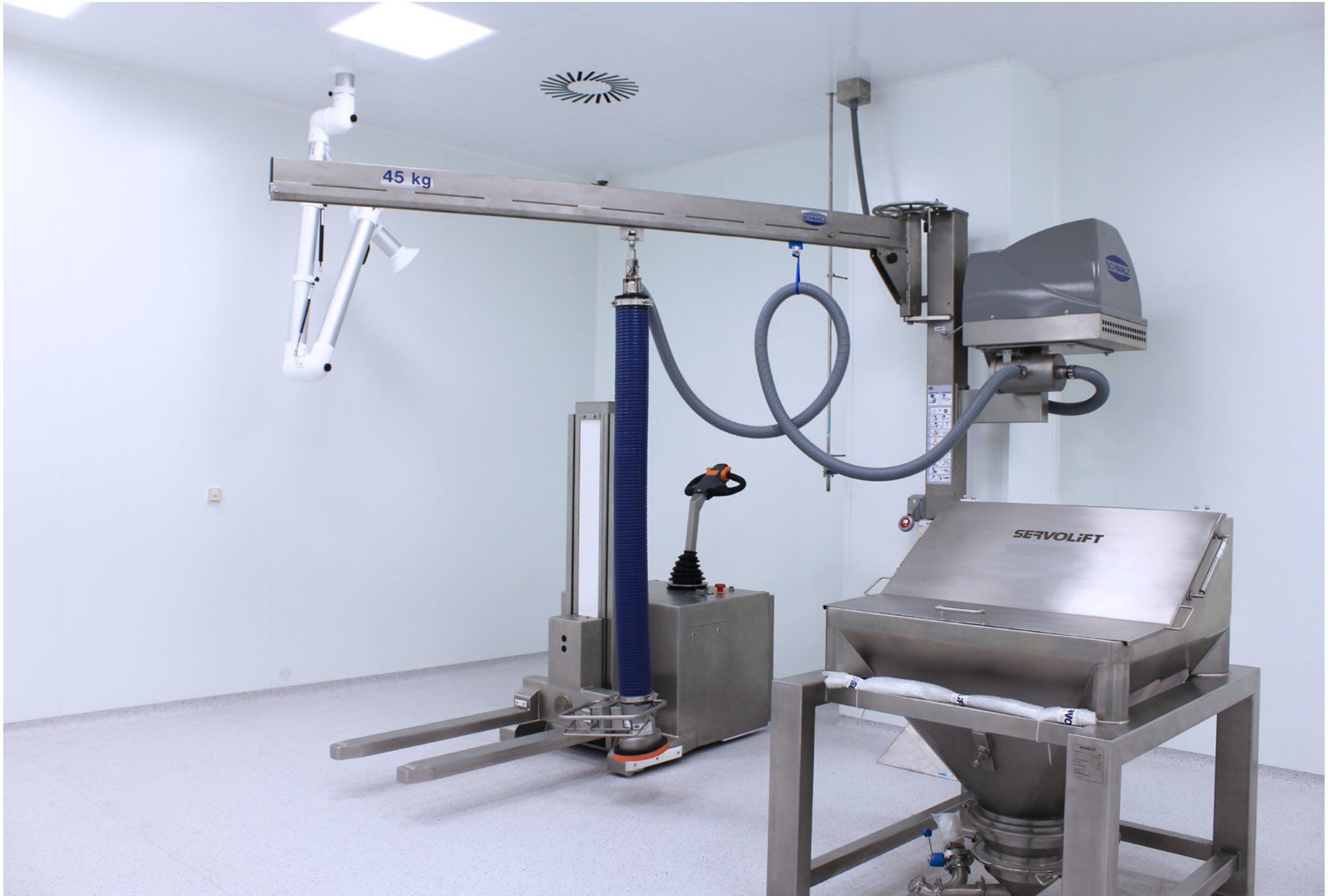
Pharmaceutical production | Canonpharma | Russia | 2020